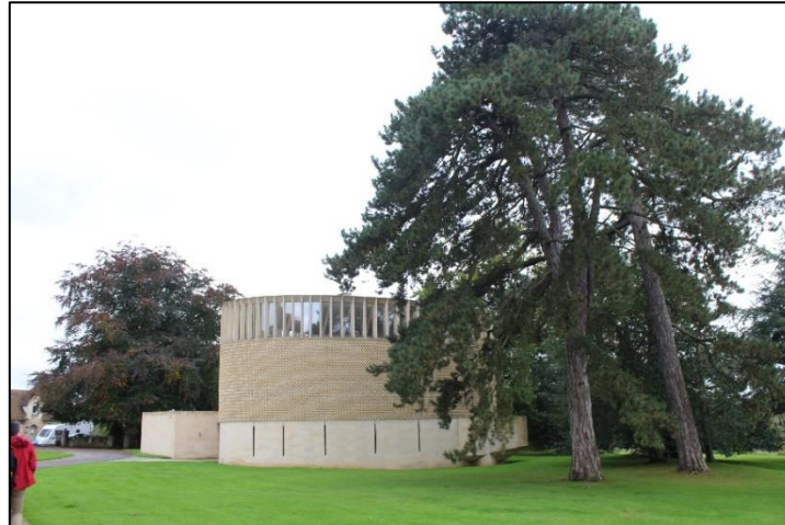
Bishop Edward King Chapel, Ripon College, Cuddesdon.

(NB This preliminary programme is based on the information current at 24.03.25.)